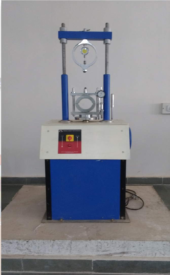
Marshal Stability Testing Machine